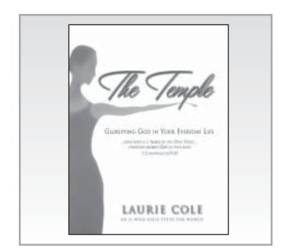
THE TEMPLE Bible Study Priority's " you glo, girl " Bible study will help you discover how to glo –glorify God.